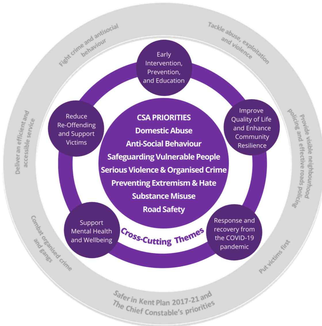
Kent CSA priorities & themes (purple). Chief Constable's priorities from the Safer in Kent Plan (grey). See Appendix E for a table display of above diagram.